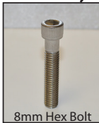
FA-TR-204HBRS w/ 4x RXD-08-LED-BRS