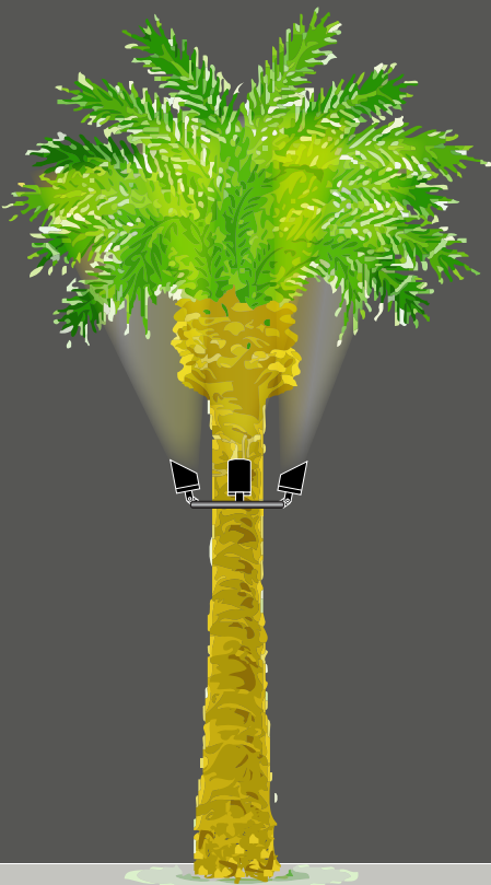
3 Up FA-TR-204H-BLT