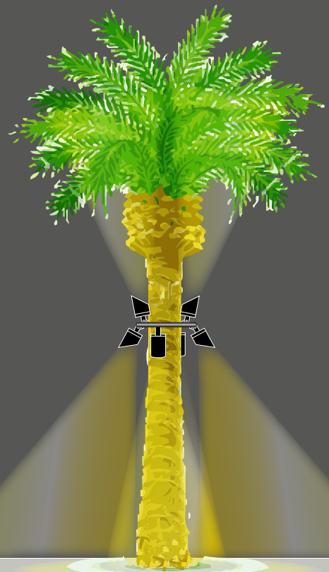
2 Up / 4 Down FA-TR-206H-BLT