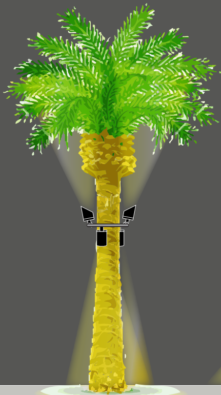
2 Up / 2 Down FA-TR-204H-BLT